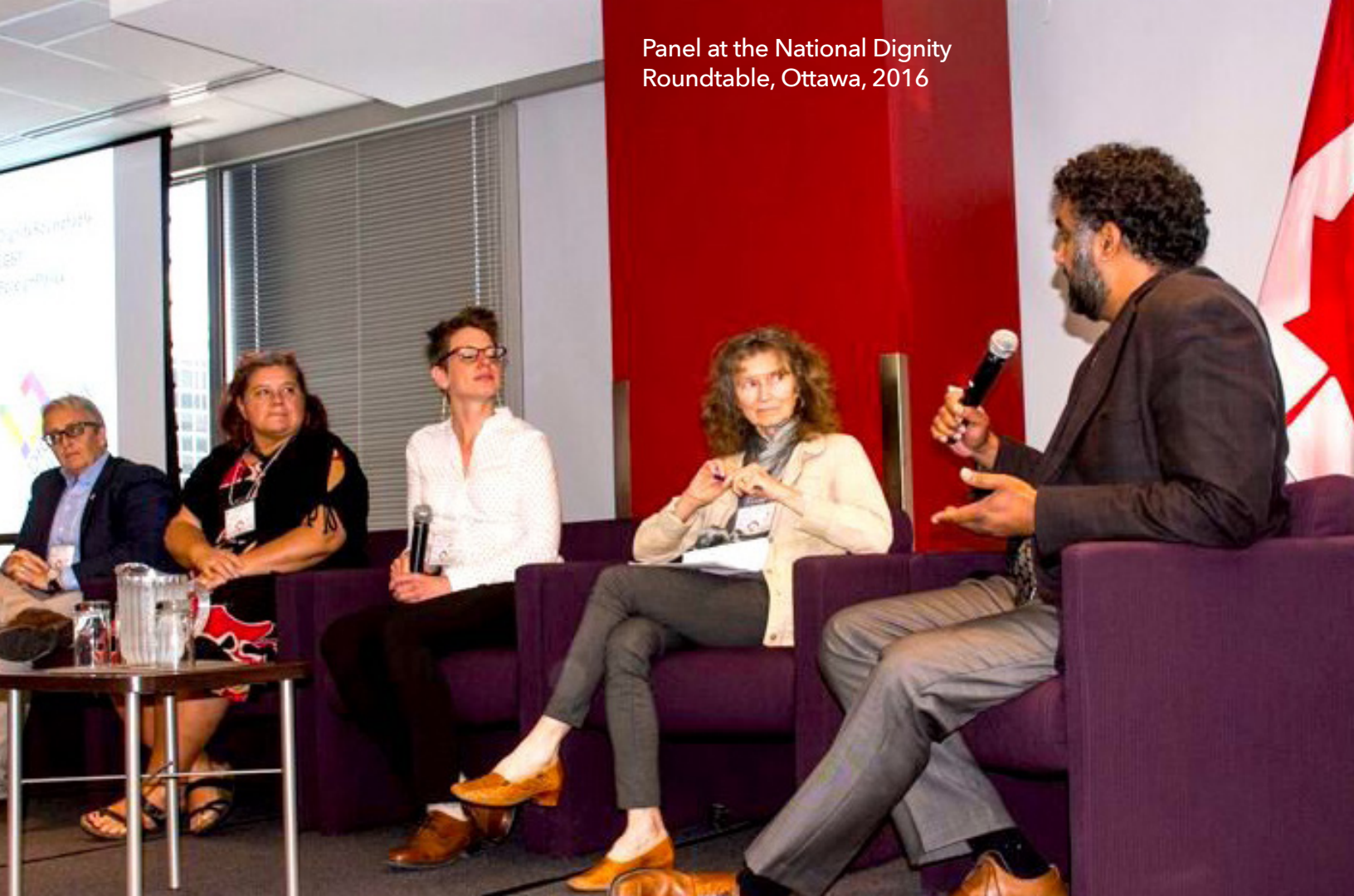
Panel at the National Dignity Roundtable, Ottawa, 2016