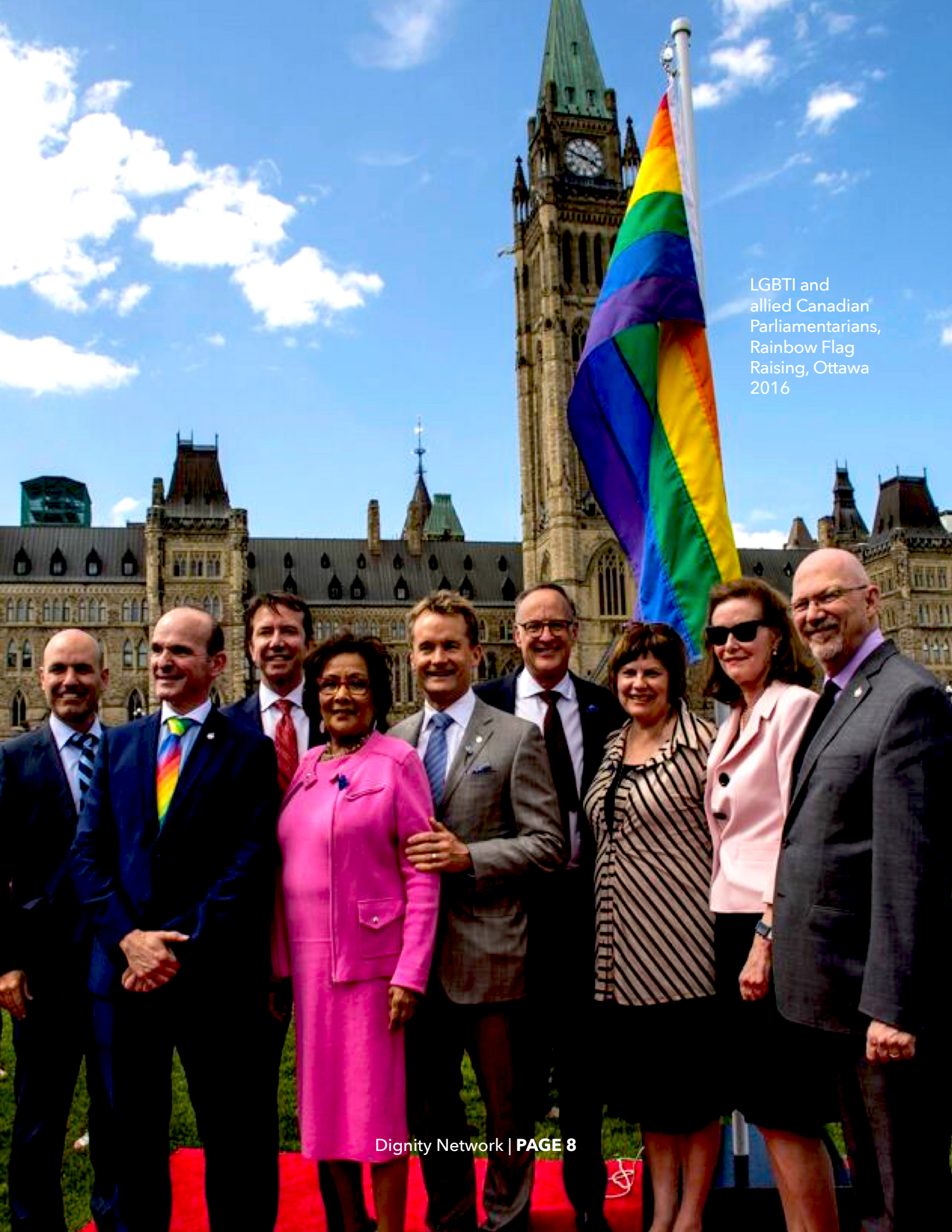
LGBTI and allied Canadian Parliamentarians, Rainbow Flag Raising, Ottawa 2016