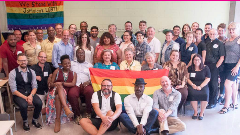
Dignity National Roundtable discussions, Montreal 2017

The network is led by a national steering committee made up of activists and leaders from a diversity of Canadian civil society organizations interested in global LGBTI issues.