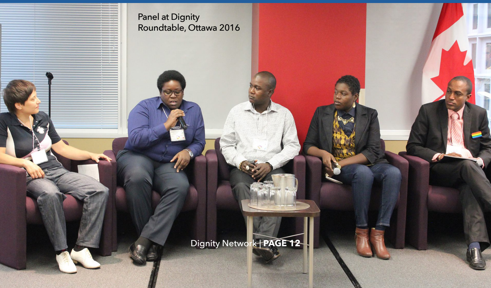
Panel at Dignity Roundtable, Ottawa 2016

Organizations in Canada interested in and working on international LGBTI human rights issues are welcome to participate in the network. Network members receive regular communications on international LGBTI issues, invitations to participate in working groups and conferences and an opportunity to help shape the network's goals. The network's Secretariat host organization is the Canadian HIV/AIDS Legal Network.