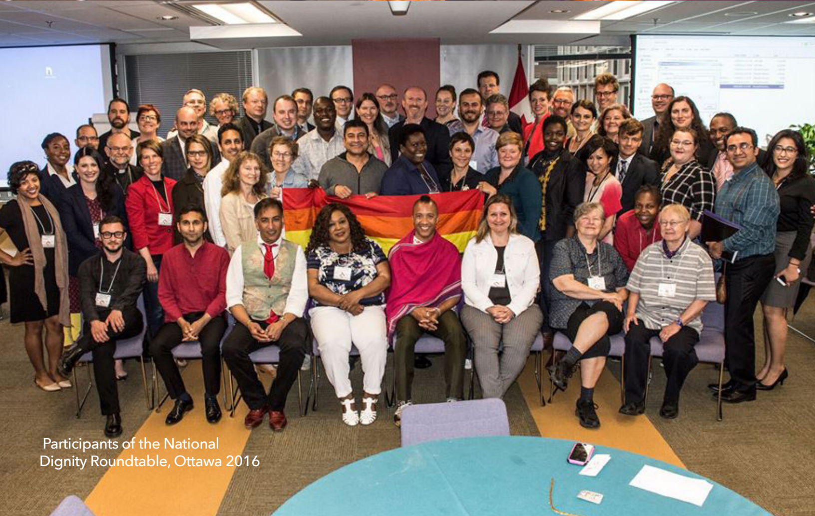
Participants of the National Dignity Roundtable, Ottawa 2016