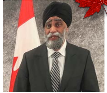
Canada's Minister of International Development giving virtual keynote address at WorldPride Human Rights Conference.