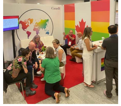
Government of Canada's booth at the WorldPride Human Rights Conference Exhibition space.